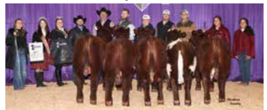
Reserve Champion Pen of 5 OKC

SULL RED KNIGHT 2030 ET SULL DREAM MAKER 9141G ET SULL DREAM ON 5158 ET PEAK VIEW COMET 37715 PEAKVIEW DAFODIL 40917 PEAK VIEW DAFFODIL 37615