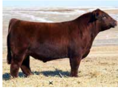
Gilman's Liberty Valance 25J