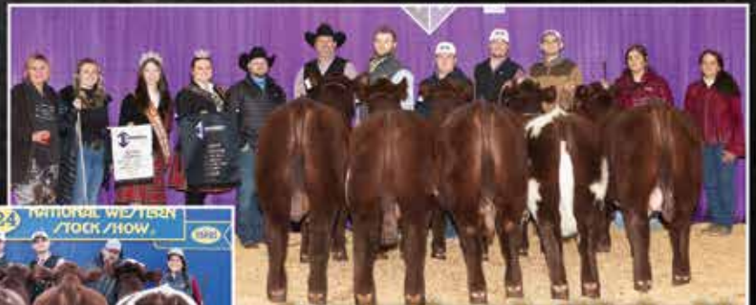
Reserve Grand Champion Pen of 5 Shorthorn Bulls 2024 Cattleman's Congress