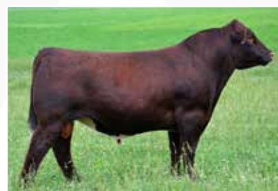
Sire - CF S/F Ultimate Reward ET