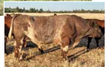
Saskvalley Outlaw 173Z