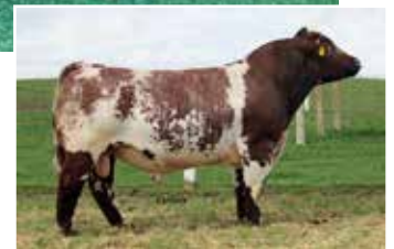
CSF Evolution HC