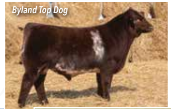
Byland Top Dog