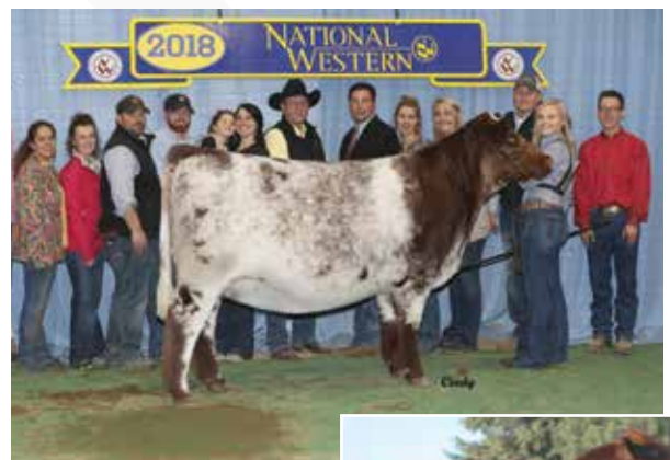
CF CSF Demi 6100 HC ET

CONSIGNED BY: CORNERSTONE FARMS, JASON 765-546-0796