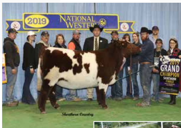
CF V8 Mona Lisa Reward 782 SOL ET