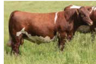
SULL Current Commodity 7630E