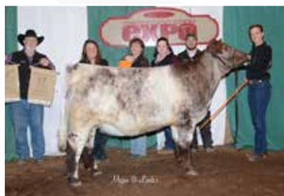
Dam - BOWL Lady Legacy ET