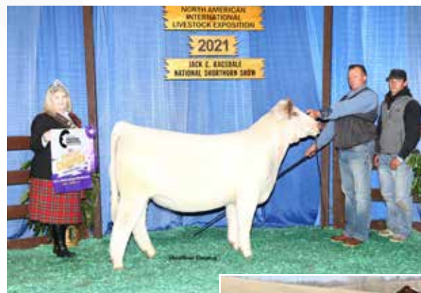
Armstrong Lady Crystal 2105 ET

CONSIGNED BY: ARMSTRONG FARMS, 724-321-3163 + LITTLE CEDAR CATTLE CO, 989-798-8223