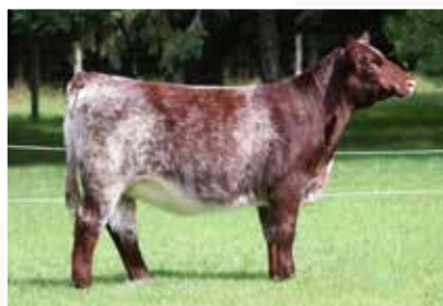
Half Sib - Top Seller in our 2021 Fall Online Sale