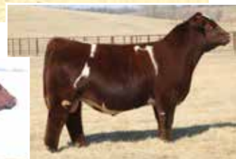
SULL Dream Maker 9141G ET