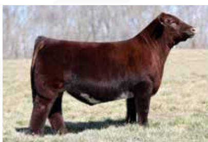
Sire - BONL Authority 908G