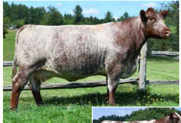
SBF Shadybrook Perfect 20 ET

CONSIGNED BY: SHADYBROOK SHORTHORNS, LLOYD 450-260-5272