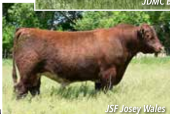
JSF Josey Wales