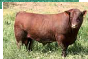
SULL Red Knight 2030 ET