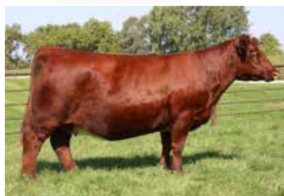
Dam - SULL Cherri 205 - 7 ET CL