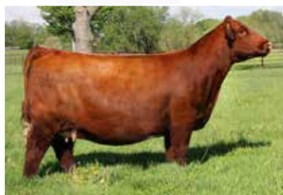
Maternal Granddam - SS Dream Lady 161 ET