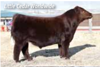
Little Cedar Worldwide

5 UNITS SEMEN - CONSIGNED BY: SULLIVAN FARMS