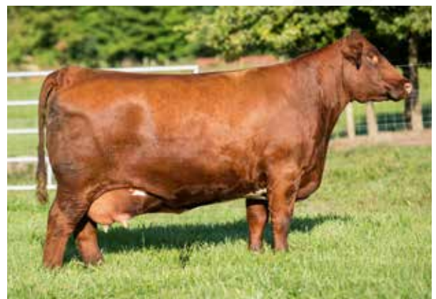
Waukaru Lassie 2024

CONSIGNED BY: BOWMAN SUPERIOR GENETICS, PHIL 765-886-5777