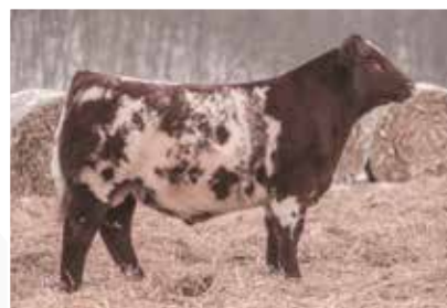
Sire - Byland Flash 9U106