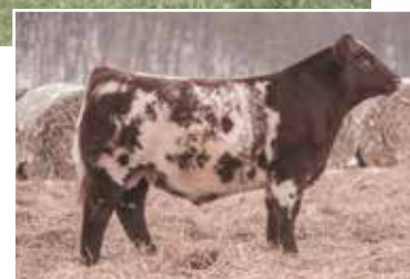
Sire of Embryos - Byland Flash 9U106