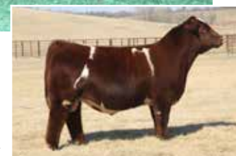
SULL Dream Maker 9141G ET