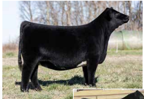
BONL Prime Lucy 903G ET