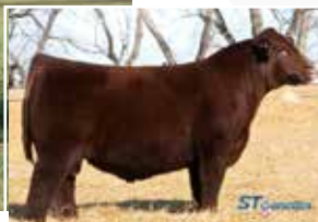
JSF Times Square