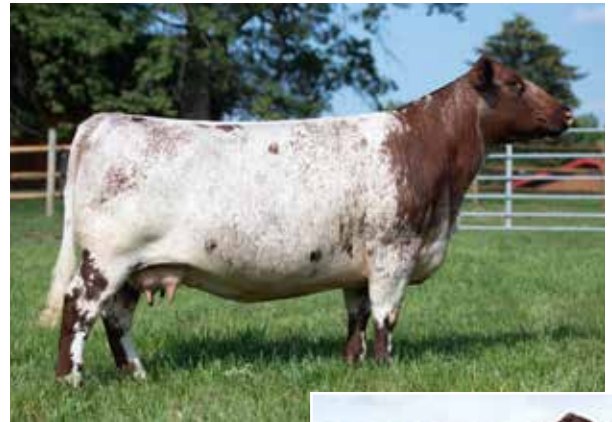
CYT Celine MX 3130 ET