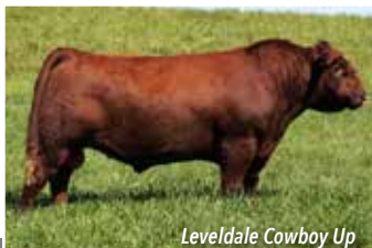
Leveldale Cowboy Up