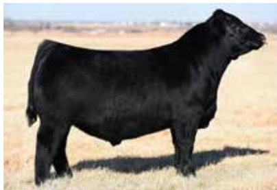
Sire - WLTR Recollection 1501 ET

CONSIGNED BY: BAILEY CATTLE CO, CODY 580-816-0001