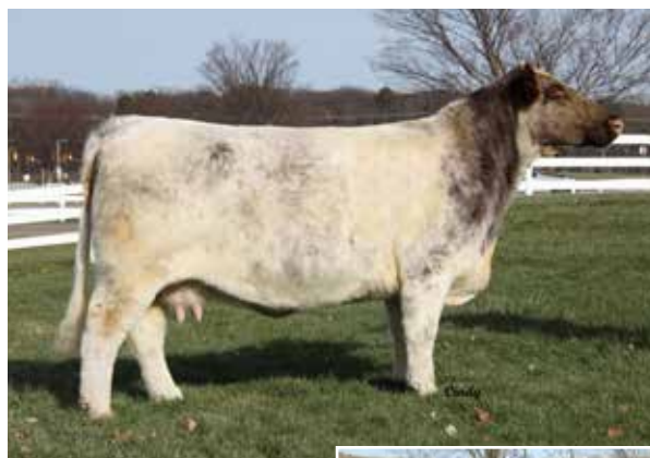
HHSF Cherri 05 ET