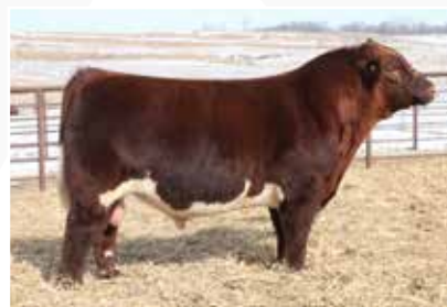
Sire - SULL Maxed Blood 4382 ET