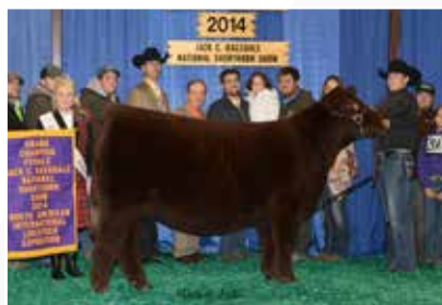
Maternal Granddam - SULL Wild Cherri 3269