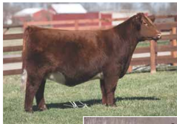
GCC Turners Margie 542 E ET