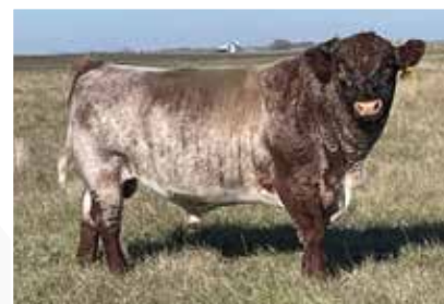
Byland Range Officer 4M15