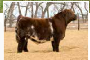
JSF Palermo 172H