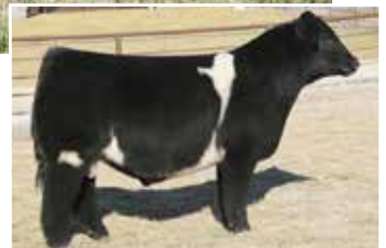
JSUL Revolution 4383 ET