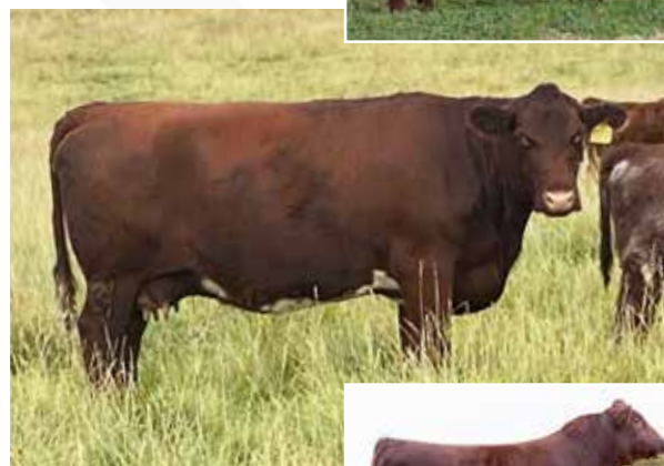
Gilman's Ruby 55D