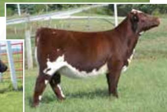
Full sib to Upper Hand mating