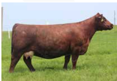
Dam - SULL Crystal's Lady 6265D ET