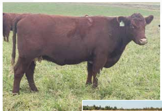
Crooked Post Lassie 31F

CONSIGNED BY: ZACH KNUTSON, 507-259-9804