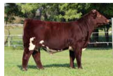
Sire of Pregnancy - CSF Long Look HC 706 ET