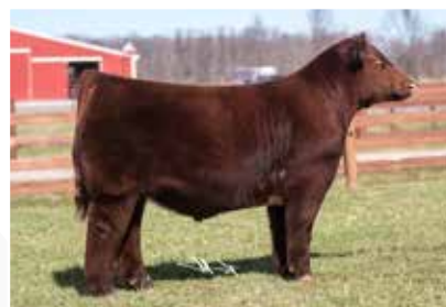
Maternal Sister - 3rd Overall B&O 2016 Junior National