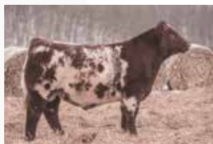
Byland Flash 9U106