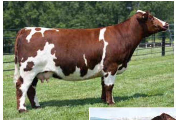
Little Cedar Felecia 1830 ET