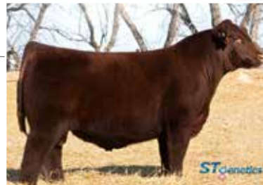
JSF Times Square 120G