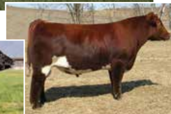
CF Solution X ET