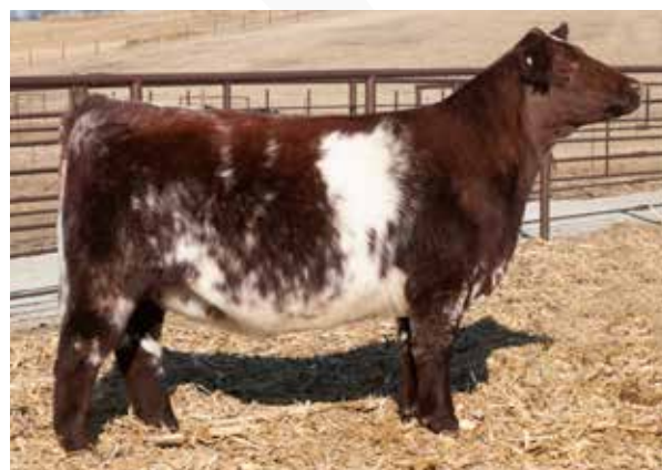
SULL Crystal's Lucys 8202F ET

CONSIGNED BY: GREENHORN CATTLE CO, DAVE 937-470-6552 + JOSH 937-681-1948