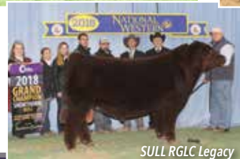
SULL RGLC Legacy