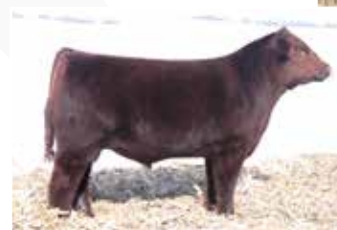
SULL Red Reward 9321