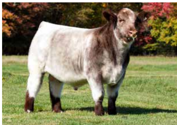
Full Sib Embryos to Millbrook Tribute FB 6023J

CONSIGNED BY: MILLBROOK FARM, BLAIR 450-521-4254