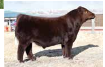
Little Cedar Worldwide