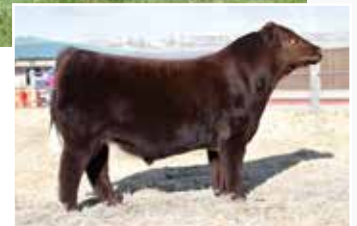
Little Cedar Worldwide