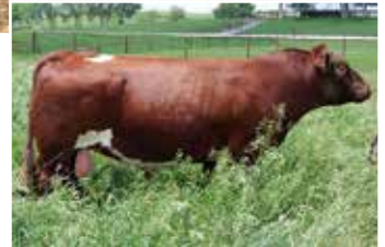
SULL Right Direction ET