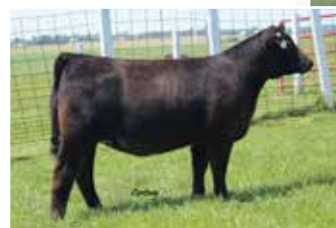
Full sib to On Point mating