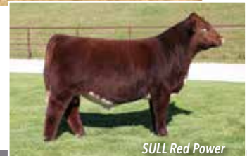
SULL Red Power