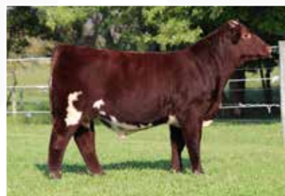
Sire - CSF Long Look HC 706 ET