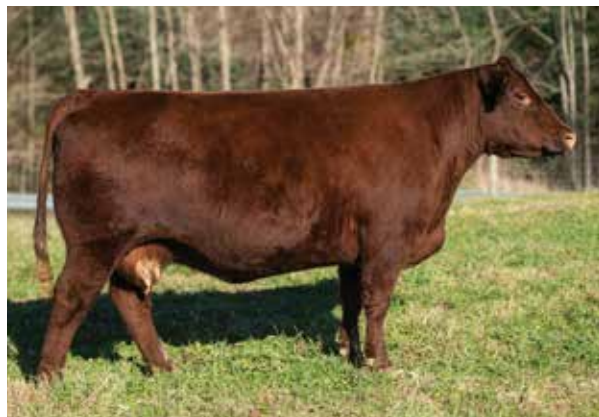
Dam - PVF Beauty Queen 56Z