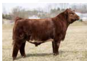
Byland Soggy Dog