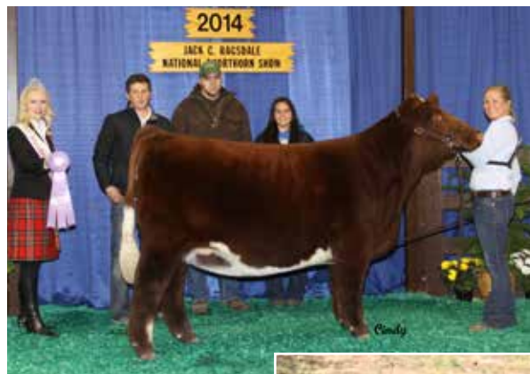
SULL Traveling Ruby ET

CONSIGNED BY: GREENHORN CATTLE CO, DAVE 937-470-6552 + JOSH 937-681-1948