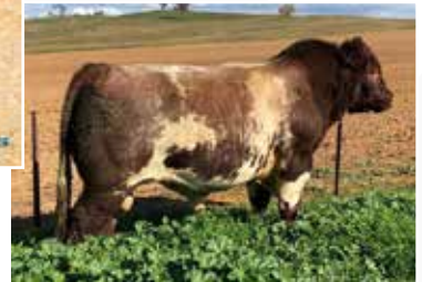
Royalla Rockstar K274