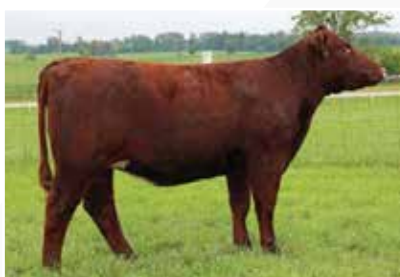
Dam - CF HHF Margie 837 HC X ET