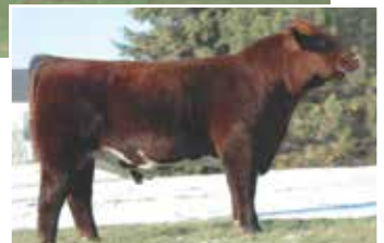
Little Cedar Aviator 503X