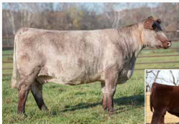
Dam - JSF/RB Meredith 7W