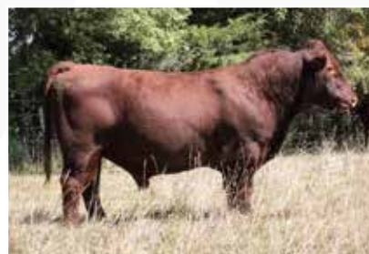
Sire - SULL Red Value 5011 ET