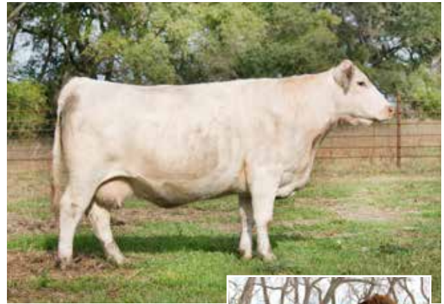
Donor - ND Orange Blossom 26X3