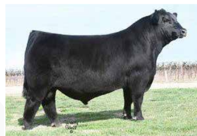
Sire - Silveiras El Capitan 6510