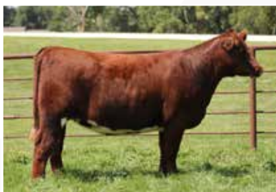
Dam - SULL Right Cherri 3808 ET