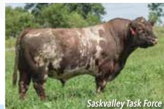
Saskvalley Task Force