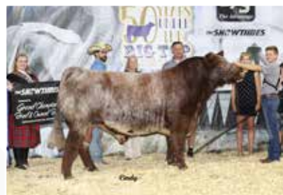
Sire - Armstrong Easy Rider 1603