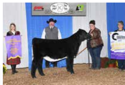
Res. Grand Champion ShorthornPlus Bull - 2021 KILE