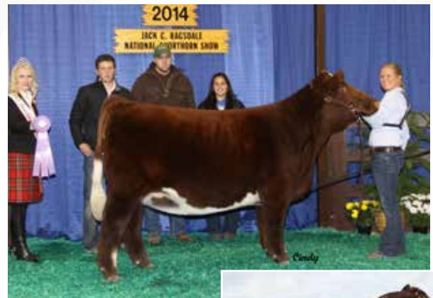
SULL Traveling Ruby ET

CONSIGNED BY: DONATHAN SHOW CATTLE, ANDY 765-220-0072