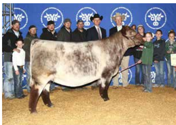
SULL Breathless Halo ET

CONSIGNED BY: BAILEY CATTLE CO, CODY 580-816-0001