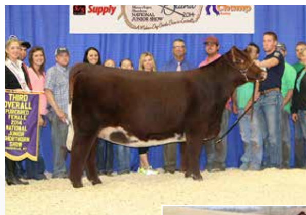
SULL Red Traveler 2405Z E ET

CONSIGNED BY: GREENHORN CATTLE CO, DAVE 937-470-6552 + JOSH 937-681-1948 + TURNER FAMILY SHORTHORNS, LUKE 217-202-2484