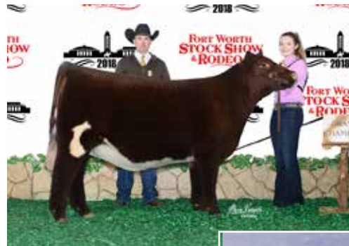
SULL Martha's Bo 7974E ET

CONSIGNED BY: WALKER FARMS, TROY 765-601-3451