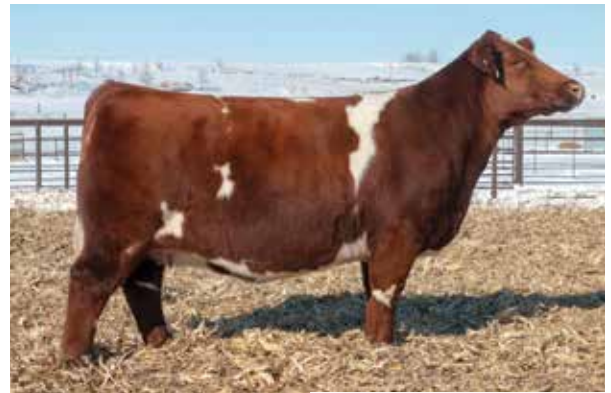
CYT Max Rosa Chrome 411 ET

CONSIGNED BY: GREENHORN CATTLE CO, DAVE 937-470-6552 + JOSH 937-681-1948 + BEACH FAMILY SHORTHORNS, 402-269-5032